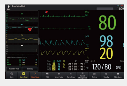
Ward rounds or nurses hand over Quickly review the patient status changes