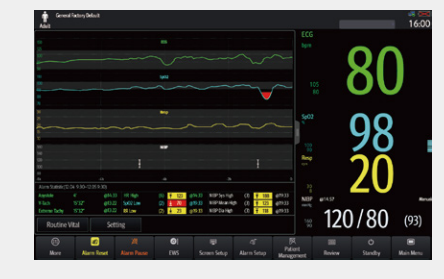
Review and analyze 24hrs waveform review and critical alarms