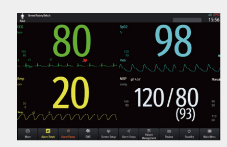
View from a distance Intuitive big numerics

Based on clinical insight, the ePM has optimized workflows to support caregivers at the bedside, swiping the touchscreen to switch between commonly used functions and interfaces, enabling clinical tasks to be completed quickly and accurately.