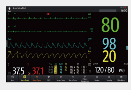
View at bedside Highlights abnormal readings