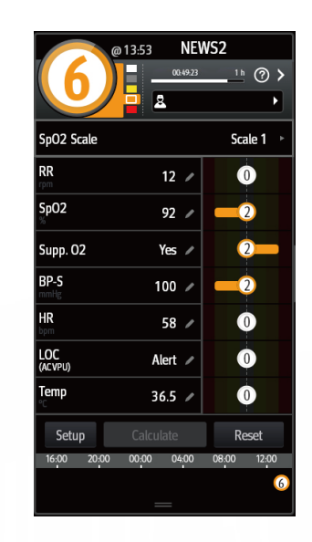
The Early Warning Score tool, as displayed on ePM devices