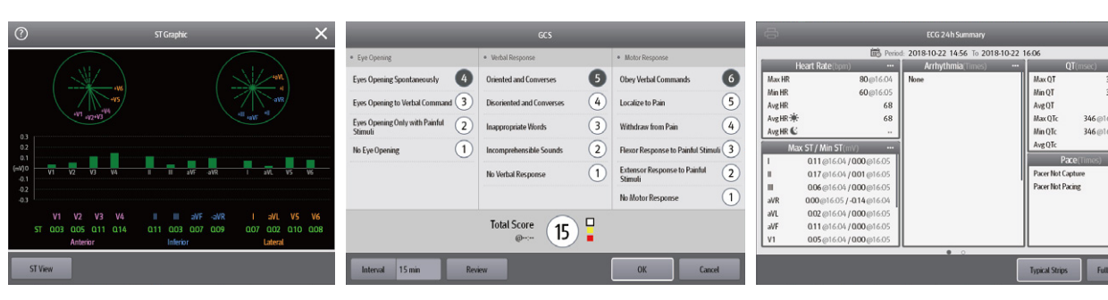
ST Graphic ™

The ePM provides efficient Clinical Assistive Applications (CAA) to help support safe and efficient decision making in mid-acuity and general ward areas.